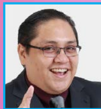
Syed D' Jailani SDJ PTE. LTD.